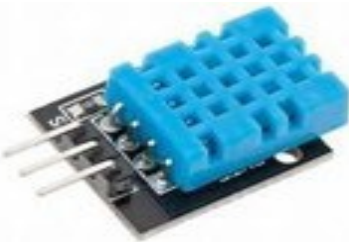
Fig. 5. Temperature and humidity sensor

The DHT11/DHT22 sensors are used for reading temperature and humidity from the surrounding area. The capacitor and thermistor play an essential role when it comes to the detection of changes in temperature and humidity levels in the air. These two factors will assist us in determining climate conditions, which may lead to landslide conditions. In case of changes in humidity and temperature levels in the environment, there will be rainfall. This sensor has a digital output that will assist us in connecting it to the microcontroller such as NodeMCU.