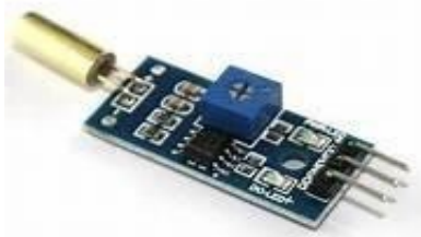
Fig. 6. Tilt sensor

The tilt sensor works as a "level" for the earth by consistently monitoring the degree of inclination of the terrain. This is probably the most important component because it detects the earliest signs of an approaching landslide, which is when the terrain starts to move or tilt. Through the use of microelectromechanical systems (MEMS) accelerometers, even the slightest angle change that cannot be seen by the naked eye can be detected. Once the earth has exceeded its "critical angle," it will trigger an alarm. As the earth usually moves or leans before a landslide occurs, the tilt sensor provides an important early warning system.