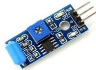
Fig. 7. Vibration sensor

This kind of sensor is used in measuring vibrations on the earth's surface as a result of any shaking or vibration of the ground or any external forces. This sensor uses either MEMS to convert vibrations into electric signals, which are then analyzed to determine the magnitude of vibrations. It is useful in sensing micro-seismic activities that are not easily detected but may point out the possibility of landslide.