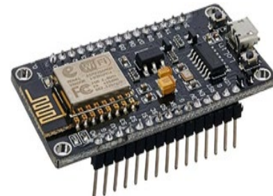
Fig. 2. NodeMCU

By facilitating direct communication with cloud platforms and web dashboards, the NodeMCU ensures that landslide conditions can be monitored from any location in real time.