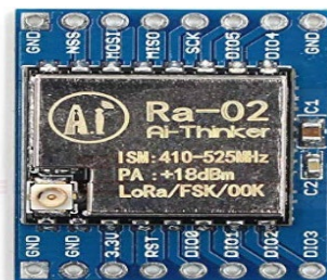
Fig. 3. LoRa

It is a wireless communication system designed for transmitting small data packets over vast distances such as over mountains or rural areas by consuming so little energy that a single battery can last several years. Unlike normal internet, which may not function in remote locations, LoRa excels in these conditions because it operates on lower radio frequencies that can effortlessly penetrate forests, concrete structures, and long stretches of air. Although it cannot be used to access the internet, LoRa is ideal for creating a connection between sensors and a control center from afar, revolutionizing life in distant locales.