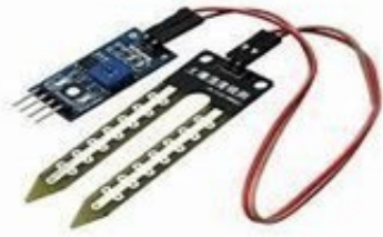
Fig. 4. Soil moisture sensor