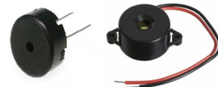
Fig. 8. Buzzer

Buzzer is an electronic component used to produce sounds upon its operation. The basic concept behind the working of a buzzer is that electrical energy is converted into sound energy. Buzzer is used in this circuit as a local alarm system. In case of any landslide threat detected by sensors, buzzer will beep as a warning signal for people around it.