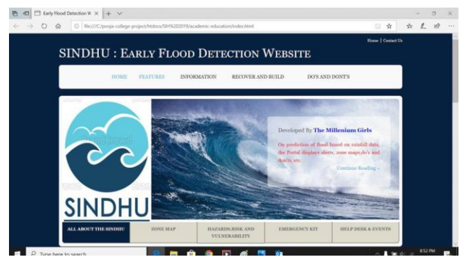
Fig. 4. Website front page 1

The website shows the do's and don'ts, emergency kits, zone map, helps desks and alerts.