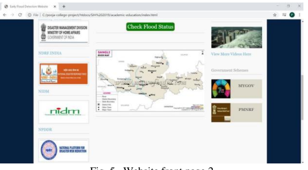
Fig. 5. Website front page 2

In the website, enter the rainfall details like - present years March to May rainfall data on average, average rainfall in past 10 days of June, average increase in rainfall from May to June.