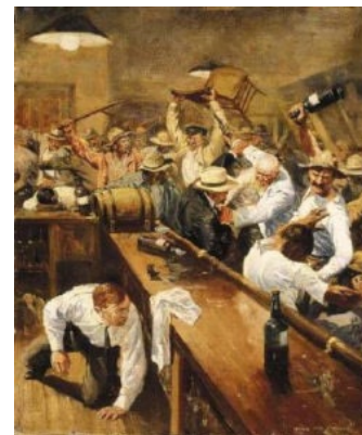
Fig. 1. Depiction of Christopher Marlowe's Last Day of Life

remain silent because it is associated with your survival. The fear that saved our ancestors is saving us till today, yet the truth needs to be revealed. Is there something called academic prostitution? Academic prostitution means you are silent even though you know that what you are teaching is simply not aligned with truth. We are talking about specifically religion and science problem. The burden of proof is problematic. Both sides are completely dissatisfied. The spark that Copernicus helped to ignite is growing up and up. There is no ending for the evolution of scientific knowledge.