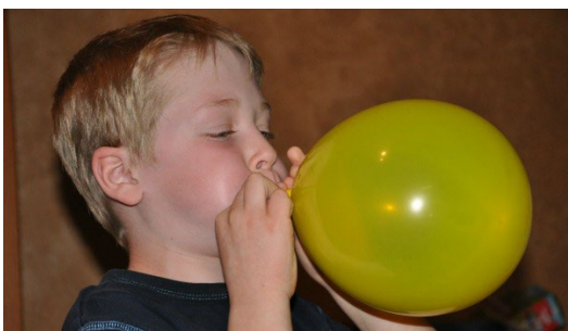
Fig. 3. Inflation of our Universe during Big Bang can be Envisioned from Blowing Air inside Balloon. Though the exact duration of the “Inflationary Period” is still unspecified, scientists often use 10^{-33} Seconds approximately

As for evolutionary of the universe from singularity to inflationary as indicated in Cixin Liu ’s Novel for no signature of Allah. The inflation theory for space is quite thought provoking as if transcendental and immanent being is blowing something for space to spread in the fastest speed ever known within second. We can imagine someone blowing air in the balloon.