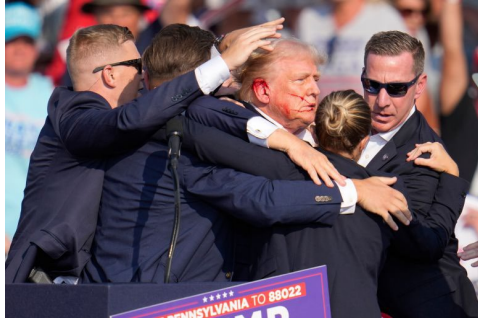
Fig. 2. Donald Trump is surrounded by US Secret Service agents as he is helped off the stage at a campaign rally in Butler, Pennsylvania, July 13, 2024

are emotionally attached to nationalism. People around the world and World leaders would show their sympathy for Trump.