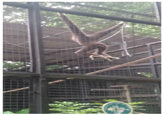
Fig. 4. Monkey with no tail. Perhaps Darwin uses this sort of characteristics for the assumption towards evolution of humans