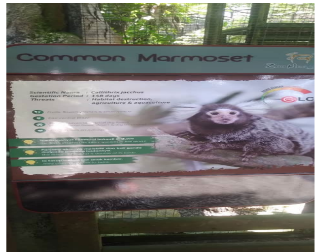
Fig. 3. Marmoset monkey (small rat size) predicted as primitive for evolutionary development of Humans.

proponents of scientific worldview may make them confused and lead them to the path of apostacy.