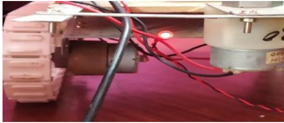
Fig. 4. Laser gun