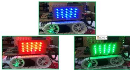
Fig. 6. Camouflage technique