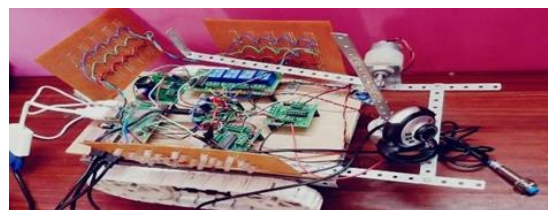
Fig. 2. Camouflage army robot