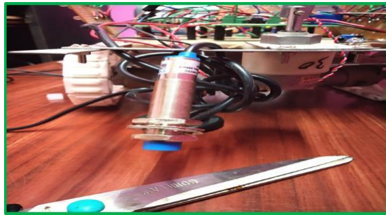
Fig. 5. Metal detection