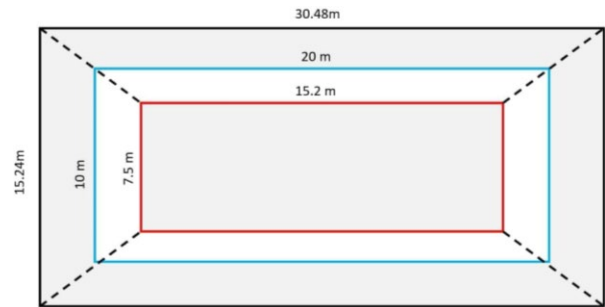
Overall pond area Base area of pond Area up to water level decreases

As a starting point for our research, we used the floating solar ponds that farmers employ on their farms as a substitute for the power plants there. I studied the random data about these ponds that is presented below in a diagrammatic manner.