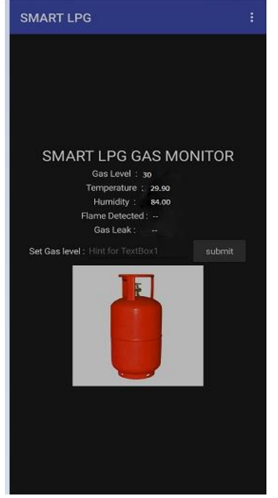
Fig. 5. Mobile application

The Fig. 4 shows the LED display that is informing about the fire which is detected in the surroundings. It alerts the user whenever the fire is detected.