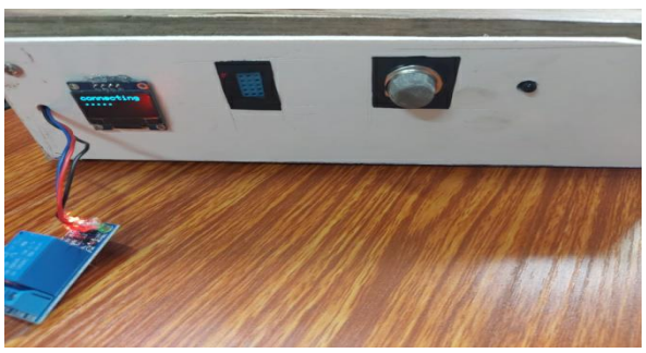
Fig. 1. The outlook of the project

This is the overview of the project. The picture highlights the components like LED display, fire sensor, temperature sensor, gas sensor and a relay which is shown in Fig. 1.