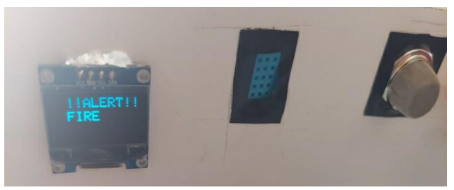
Fig. 4. Gas alert on display

The Fig. 3 depicts the circuit diagram of the project and the component connections that are made using the sensor.