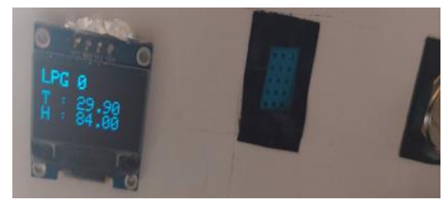
Fig. 2. LED display

This is the overview of the project. The picture highlights the components like LED display, fire sensor, temperature sensor, gas sensor and a relay which is shown in Fig. 1.